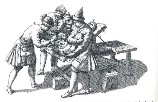
Figure 5.20. The Grand Appareil. B, Left hand holding the sound. C, Right hand holding the lancet. FF, Hands of the assistant retracting the scrotum. (From Alghisi: Litotomia Ovvero del Cavar la Pietra, 1707.)

Before embarking on local history, it seems appropriate to include a brief review of the ancient dialogues and techniques regarding treatments of urinary tract disorders. Afflictions of the urinary system as well as ceremonial rituals dealing with the phallus have been recorded and depicted through the ages. The Ebers papyrus, an Egyptian medical papyrus dating from 1500 B.C., refers to "retention of urine" and enumerates various prescriptions, mostly empiric, for treatments regulating the "flow of urine." Descriptions of surgery for bladder stones are recorded in ancient Hindu texts, as are ceremonies dealing with sacrifice of the prepuce to the gods. The Hindu system of medicine also notes the use of catheters for urinary retention, surgical drainage of scrotal abscesses, and urethral instillations for what was likely gonorrhea. In a similar vein, there are recordings of urological diseases and treatments in ancient Chinese, Babylonian, Hebrew, Persian, and Armenian literature. (1)