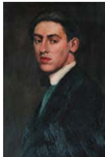
Charles Demuth (1883-1935) Self-portrait

The author traces the very early science, the search for a cause and underlying physiology, and the application of this knowledge to the clinical treatment of the disease. Local folk treatments, and early pharmaceuticals are also explored. Finally, there is the story of noted local artist, Charles Demuth, who was an early recipient of insulin.