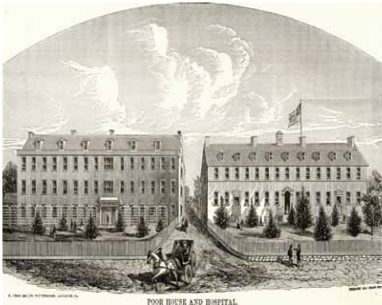
Fig. 3. The Lancaster County Hospital, built on East King Street 1799-1801, also served as a poor house. It is considered to be the second oldest hospital in the United States still in existence, predated only by the Pennsylvania Hospital in Philadelphia.