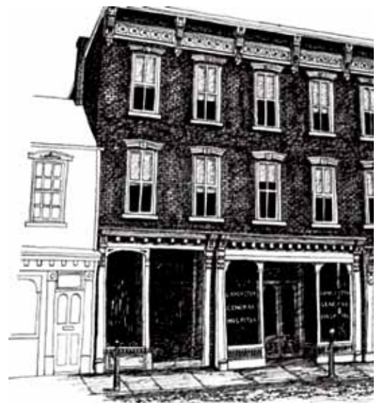
Fig. 4. The original Lancaster General Hospital was founded in 1893 in this small home at 322 N. Queen St. Associating hospitalization with death, most of Lancaster's population preferred to have their medical and surgical treatments at home.

• John Light Atlee was truly a renaissance man, and was instrumental in minimizing the scourge of cholera in Lancaster by working with the Sanitary Committee of Lancaster County to establish a clean, public water supply. 8