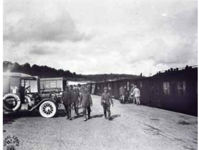
Fig. 3. View of the receiving and dispatching platform in front of Evacuation Hospitals Nos. 6 and 7 at Souilly. The soldiers walking towards the photographer are German prisoners of war.

Evacuation Hospital No. 7 started operating as a hospital again on August 28, but at first the cases were mainly personnel with influenza/Spanish flu (see below). The Battle of St. Mihiel, the only offensive launched solely by the U.S. Army in WWI, 5 commenced on September 12 and ended September 14. 9,10